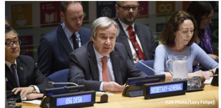
Secretary-General António Guterres (centre) addresses the closing session of the High-level Political Forum on Sustainable Development

As in previous years, the forum closed with the adoption of a Ministerial Declaration in which member states reaffirmed their commitment to effectively implementing the 2030 Agenda for Sustainable Development for all people, everywhere.