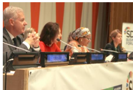
Opening plenary of the SDG Business Forum

Amina J. Mohammed, Deputy Secretary-General of the United Nations opened the session by underlining the critical role that a dynamically engaged business community has to play in realizing the SDGs and noted that it is “encouraging to see business responding to the 2030 agenda at an unprecedented scale”.