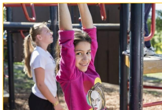
A child resident at Hvalsmoen Transit Centre plays on a SI Ringerike activity outing.

not literate in national languages. By running language courses for women, SI Ringerike provides community-based support and improves women's access to essential services.