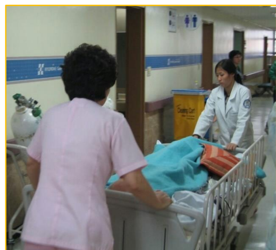
Students visit Namyangju Hyundai Hospital

By including healthcare as part of SI Seoseoul's mentoring programme, SI Seoseoul is able to support the students' rehabilitation and provide community-based support that is known to improve health outcomes, and acknowledge the inter-related nature of education and health. By connecting health and education, educational approaches can be appropriately adapted to the specific needs of the students during post-trauma development.