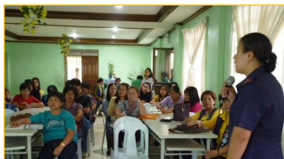
Igorot Women in the Philippines participate in a workshop to develop advocacy skills.

club was asked to come and run the forums with schools and other community groups.