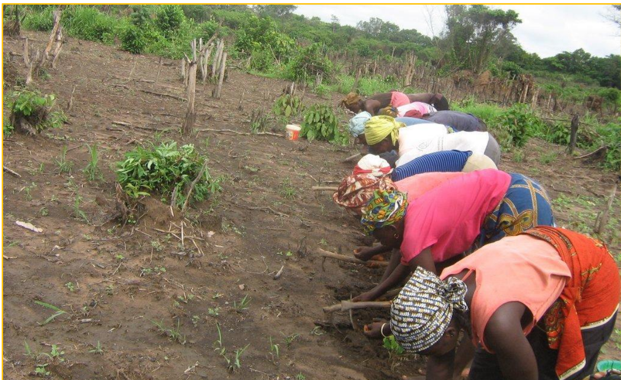
Women from Mokori Village farming as part of the Kori Project

Financing for development is key for the ongoing success of projects like the Kori Project. Many grassroots driven projects rely upon NGO and civil society funding; more support, including cash injections, should be made available to effective civil society projects to ensure their efficacy and longevity. This support can develop and maintain resources that ensure project expansion.