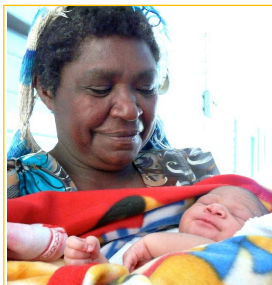
Mother & baby, beneficiaries of Birthing in the Pacific

Birthing dolls are an essential tool that train midwives, birth attendants and others in how to manage and treat complications in birth, and ensures that women access the highest possible quality of healthcare whilst in labour. This beneficial impact of this training will be particularly pronounced in rural areas, where isolation from medical facilities increase the risk of maternal and infant death, as well as other health issues.