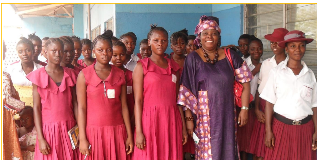
Girls attending school as a result of the Kori Project

More than 200 million women and girls have undergone female genital mutilation, mostly in Africa, the Middle East and Asia where FGM is concentrated. x The adverse effects of FGM can include severe bleeding, sexual and reproductive health issues, and in extreme cases, death - there are no positive benefits. FGM is a violation of the human rights of women and girls, in order to achieve the SDGs