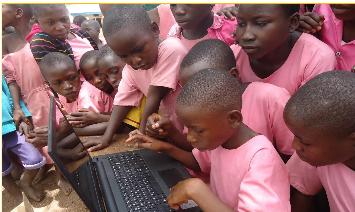
Girls at Musasa Primary School in rural Western Uganda learn to use laptops powered by solar energy.

'See Solar, Cook Solar' worked with two schools in rural western Uganda, Kinyaminagha School and Musasa School, each school with 700 pupils. Initially the project was developed to provide solar lighting and cooking facilities to the school and community, therefore increasing access to and the quality of education. However, the project quickly progressed to fulfil other needs in line with the