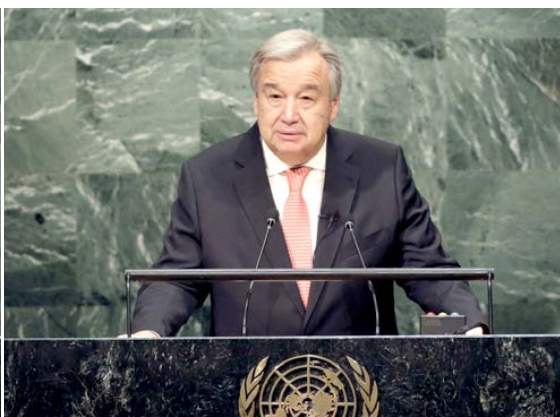
M. Antonio Guterres Secrétaire général de l'ONU

The implementation of development strategies such as the poverty reduction strategy (2009-2011) and the accelerated development and job creation strategy (2013-2017), highlighted the need for Togo to optimise its resource and partners mobilisation strategies for the realisation of its development goals. Lack of enough resources to meet the country's development agenda leads to budgetary deficit; funding for which has significantly increased the country's debt level.