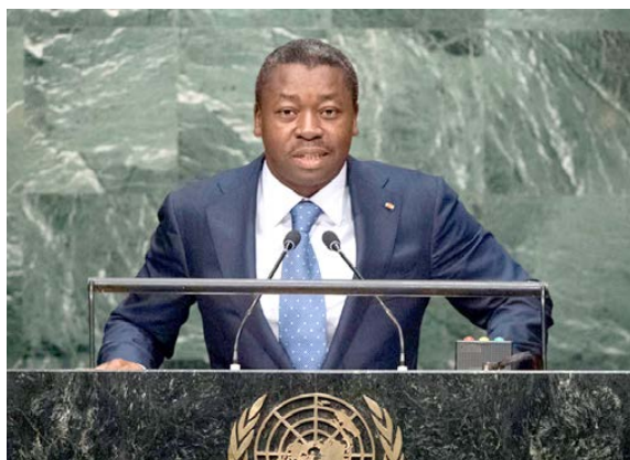
S.E.M. Faure E. Gnanassingbé Président de la république