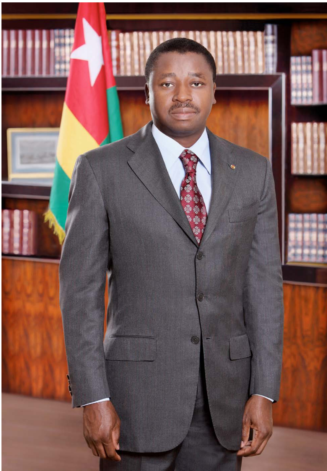
S.E.M. FAURE E. GNASSINGBÉ PRESIDENT OF REPUBLIC