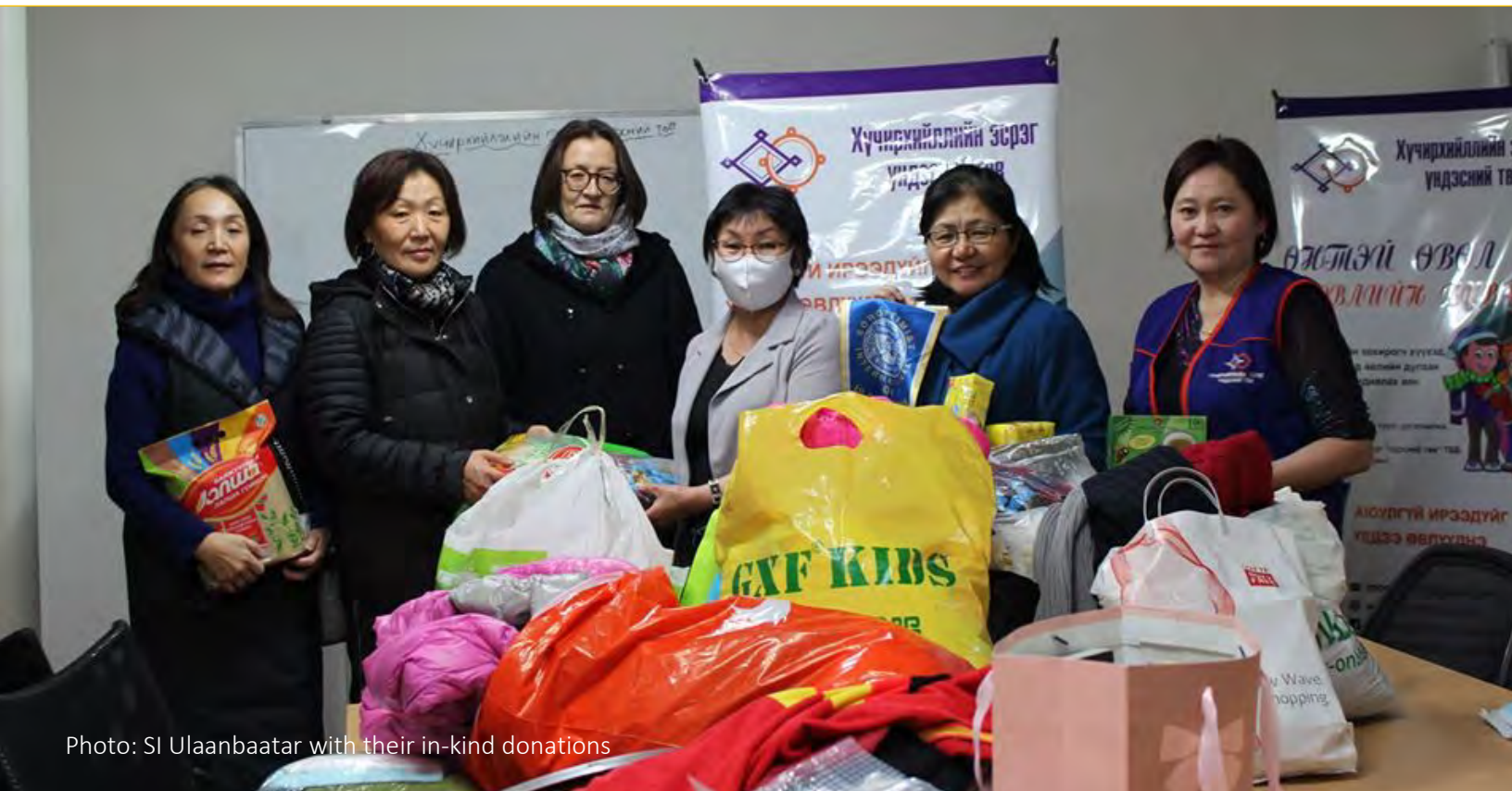
Photo: SI Ulaanbaatar with their in-kind donations

during the COVID-19 pandemic, the club donated food, children’s clothing and toys to the Centre to help during this time of crisis. For many of the residents who arrive with nothing, this will give them solace and reassurance.