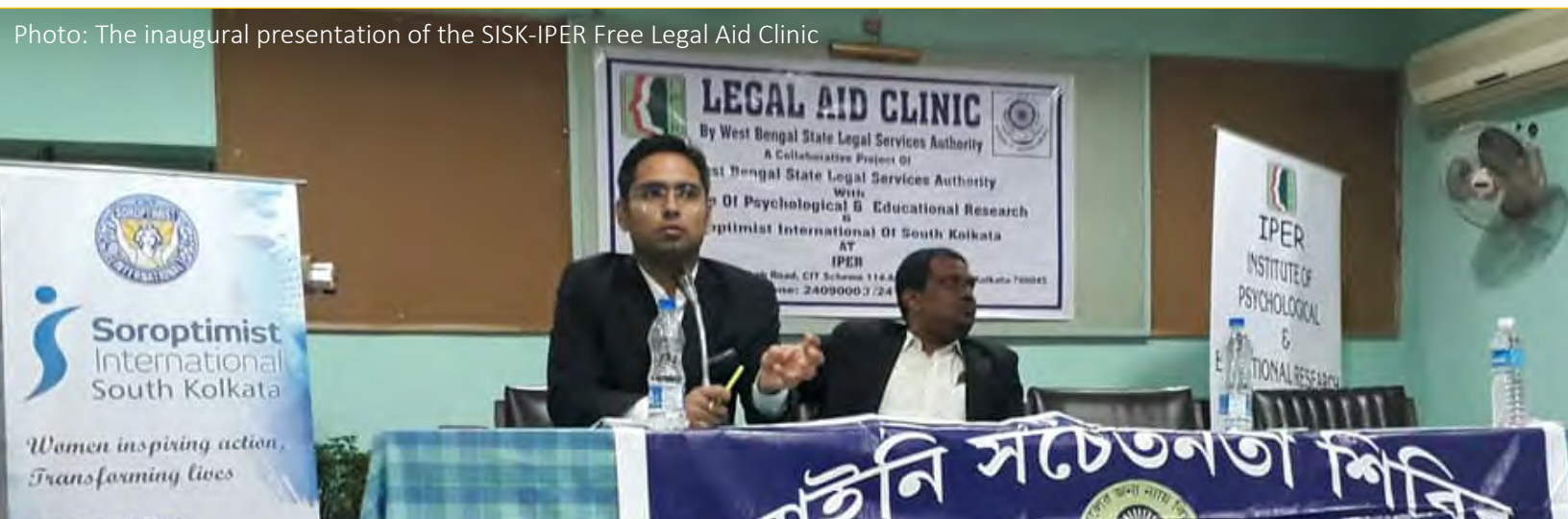
Photo: The inaugural presentation of the SISK-IPER Free Legal Aid Clinic

The first clinic was held on the 11 th of March, and already five women sought advice and guidance from lawyers. Their cases ranged from being about marital issues, property and inheritance rights, and professional matters. Already women could further their cases with the District Legal Services Authority. As trust and knowledge of the SISK-IPER Free Legal Aid Clinic grows, more women will use this service. It is projected that hundreds of women will be able to use this service. With many targets within the SDGs focusing upon the creation of laws, including for equality, it is also important to remember that having laws in the statute books is not enough. All women and girls, including those who experience intersecting discrimination, must be able to access and benefit from those laws in order for legislation to fulfil its purpose. Policies, services and awareness raising around these laws are a critical means of implementation.