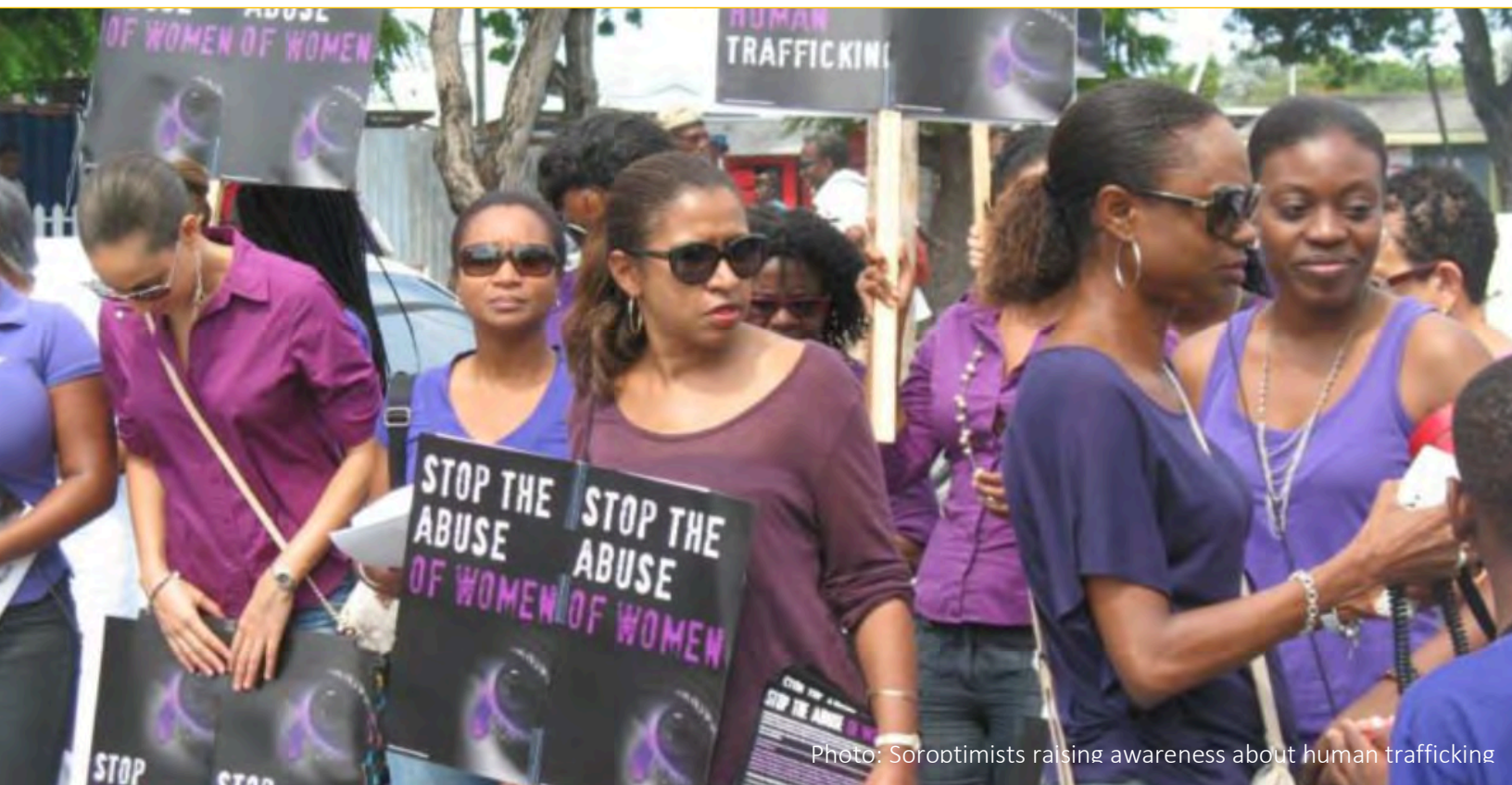
Photo: Soroptimists raising awareness about human trafficking

Survivors of trafficking repeatedly report that one of the biggest barriers to recovery is being able to provide for themselves. Many are trafficked as children and are without qualifications. Appropriate training and resources—adjusted to account for the psychosocial care survivors may need—are urgently required to ensure that trafficked women are not at risk of living in poverty.