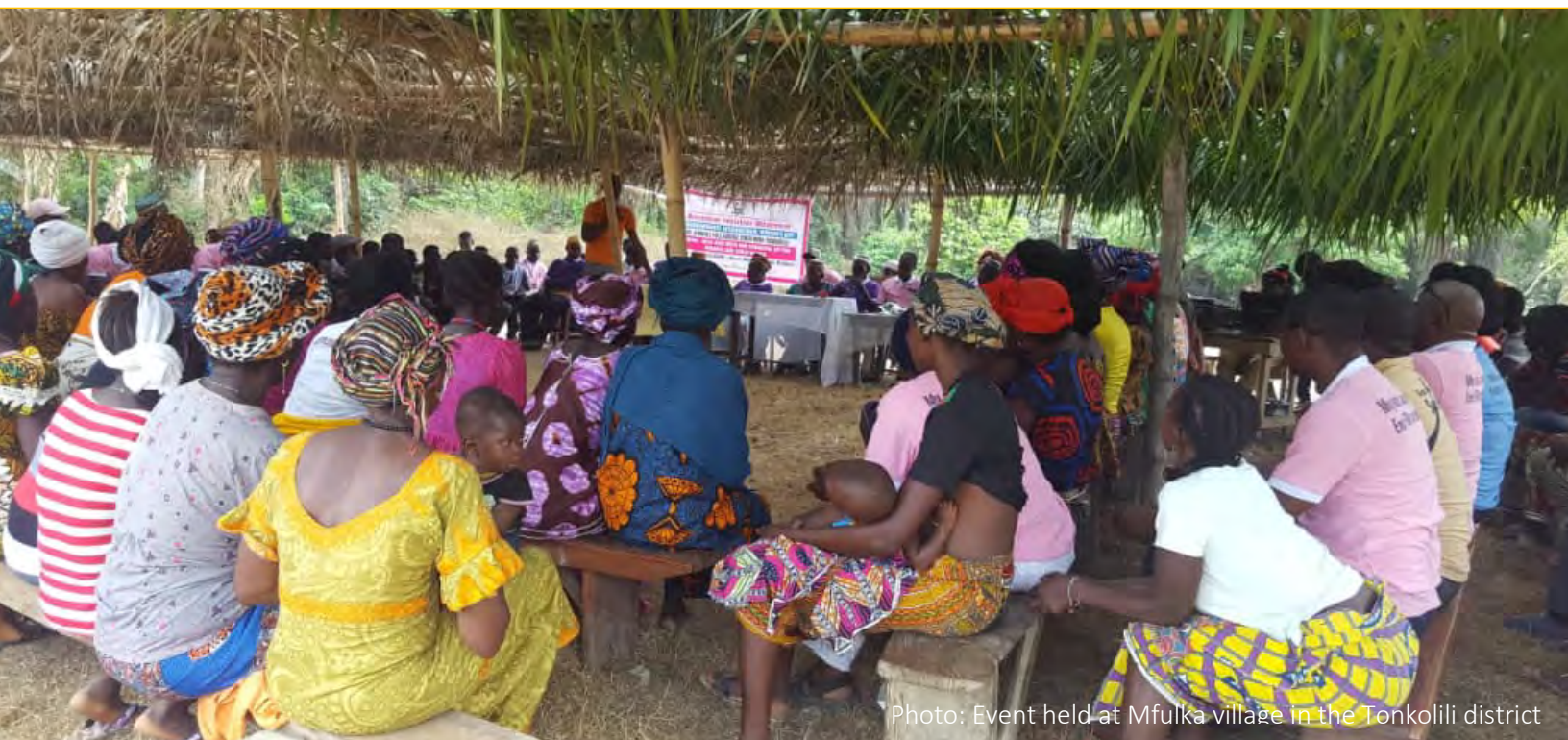
Photo: Event held at Mfulka village in the Tonkolili district