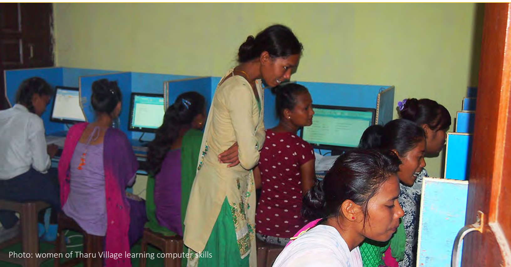
Photo: women of Tharu Village learning computer skills

with the Educate to Lead Appeal, Maiti Nepal was able to invest in their transit house in Kailali District. This transit house provides its 90 residents with psycho-social services including counselling, social reintegration and income generation training. This programme therefore not only tackles the root causes of trafficking, including poverty, but it enables women to return to their communities to start businesses and support wider development.